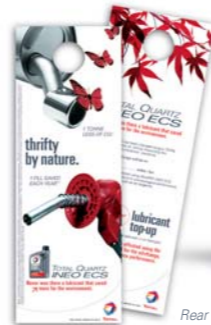
Rear view mirror mini-tie