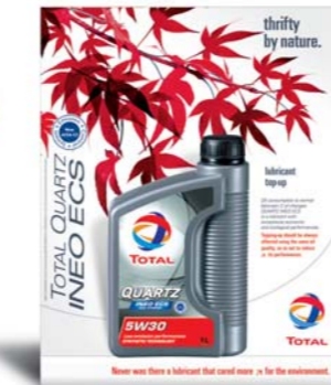
Counter for top-up cans